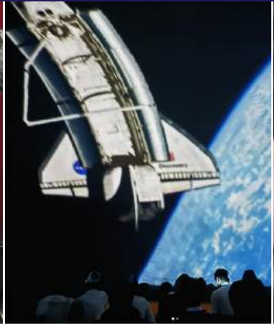
The Mobile Planetarium