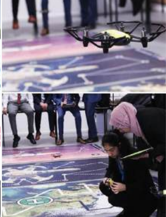
Drone coding workshop