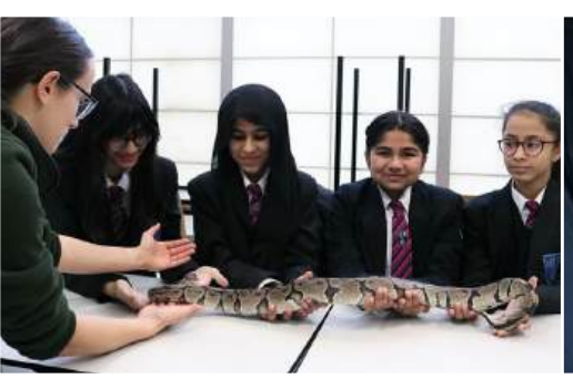
Animal Roadshow treating students to amazing animal encounters