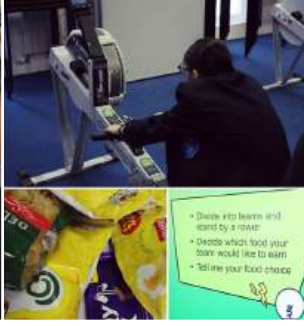
Staff from Elevation X led the "What is a Watt?" Workshop