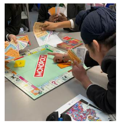
Pupil feedback: "fun and enjoyable". "It promoted Inclusion"; "I loved it"; "I made new friends".

The students have run a pilot club and are now finalising the event details. Please look out for posters and information on Sharepoint for times, location and how to sign up.