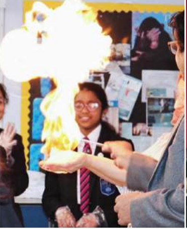
Hands on explosive science show!